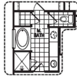
Opt Master Bath